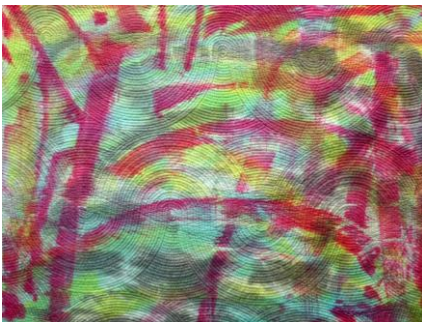
Detail image of artwork

Each artwork is designed to be hung in either a vertical or horizontal orientation which gives it great versatility in display options as well as changes the dynamic of the piece each time it is rotated. The back of the artwork shows the incorporated hanging system that just needs the accompanying wood slat inserted and it is ready to hang from any gallery system or with just two nails.